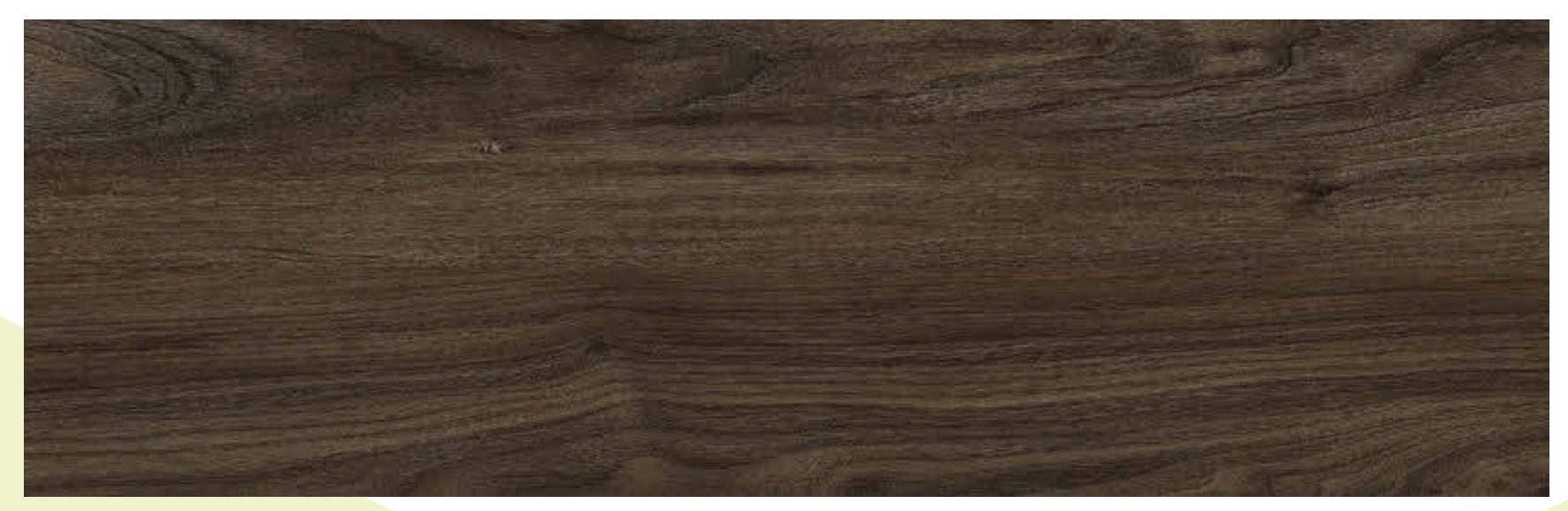
European Walnut Chocolate