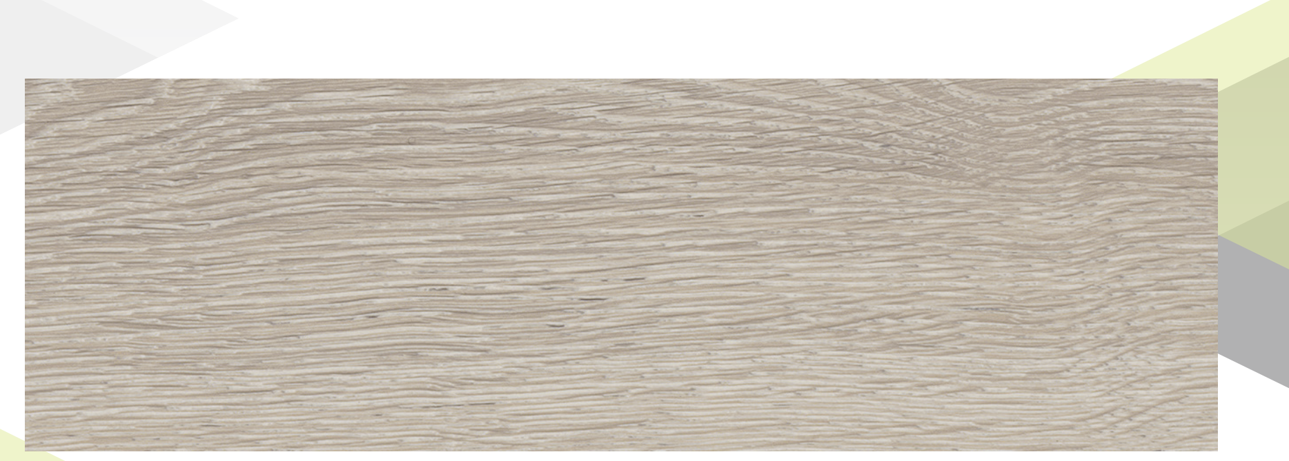
Tuscany Oak Snow