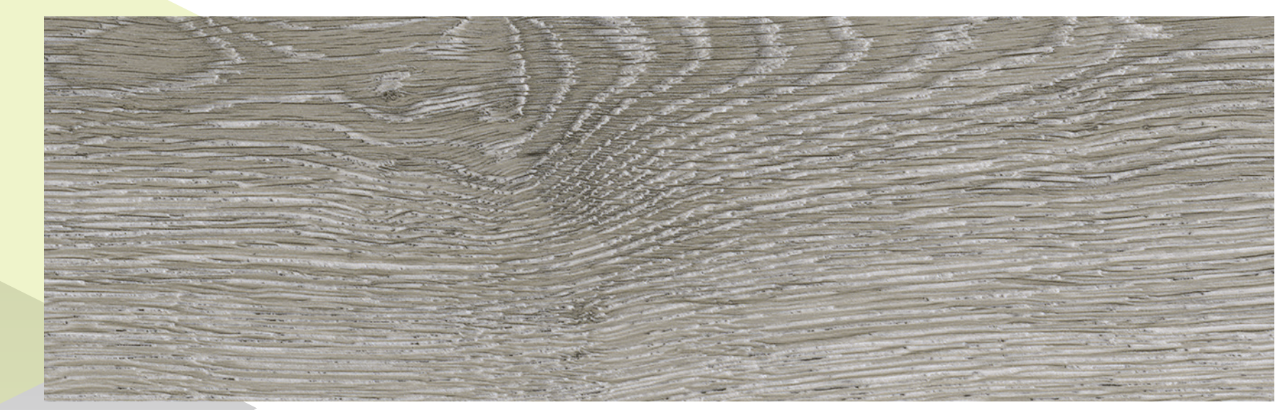
Tuscany Oak Mist