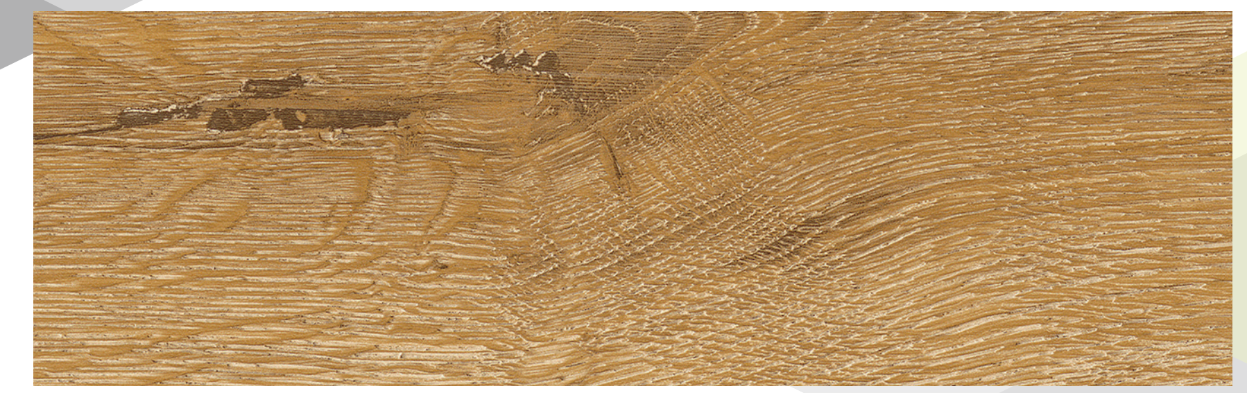
Tuscany Oak Medallion