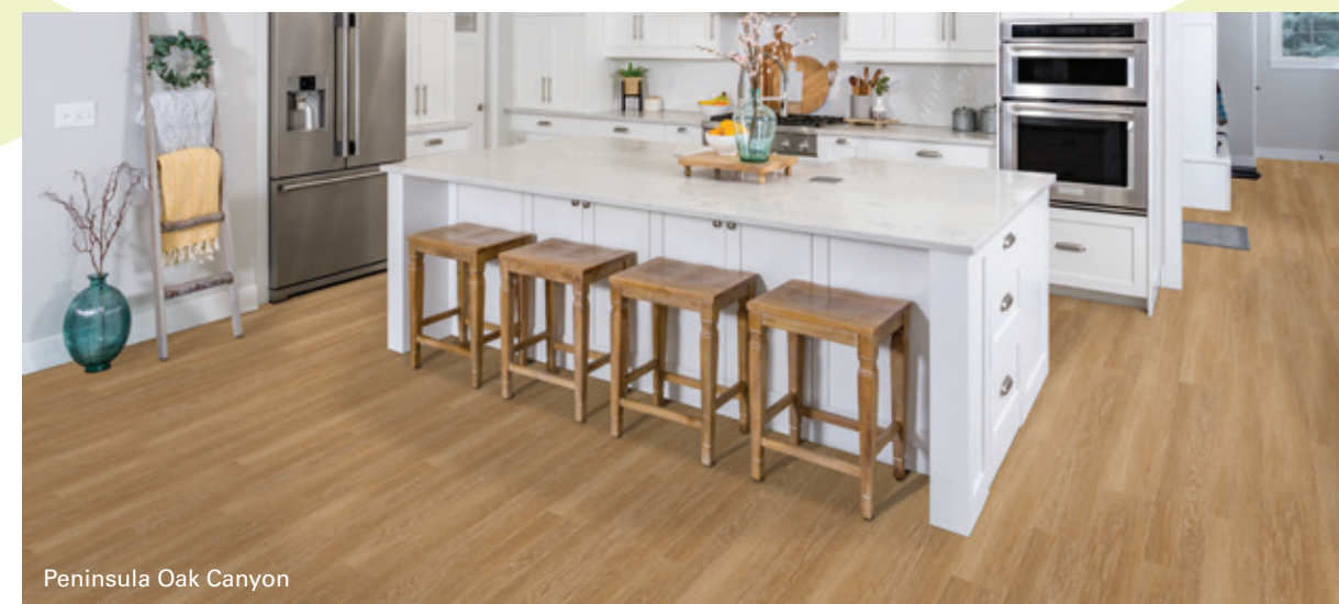
Peninsula Oak Canyon