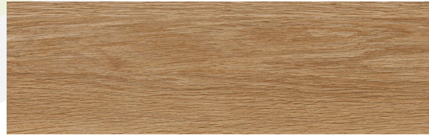
Peninsula Oak Canyon