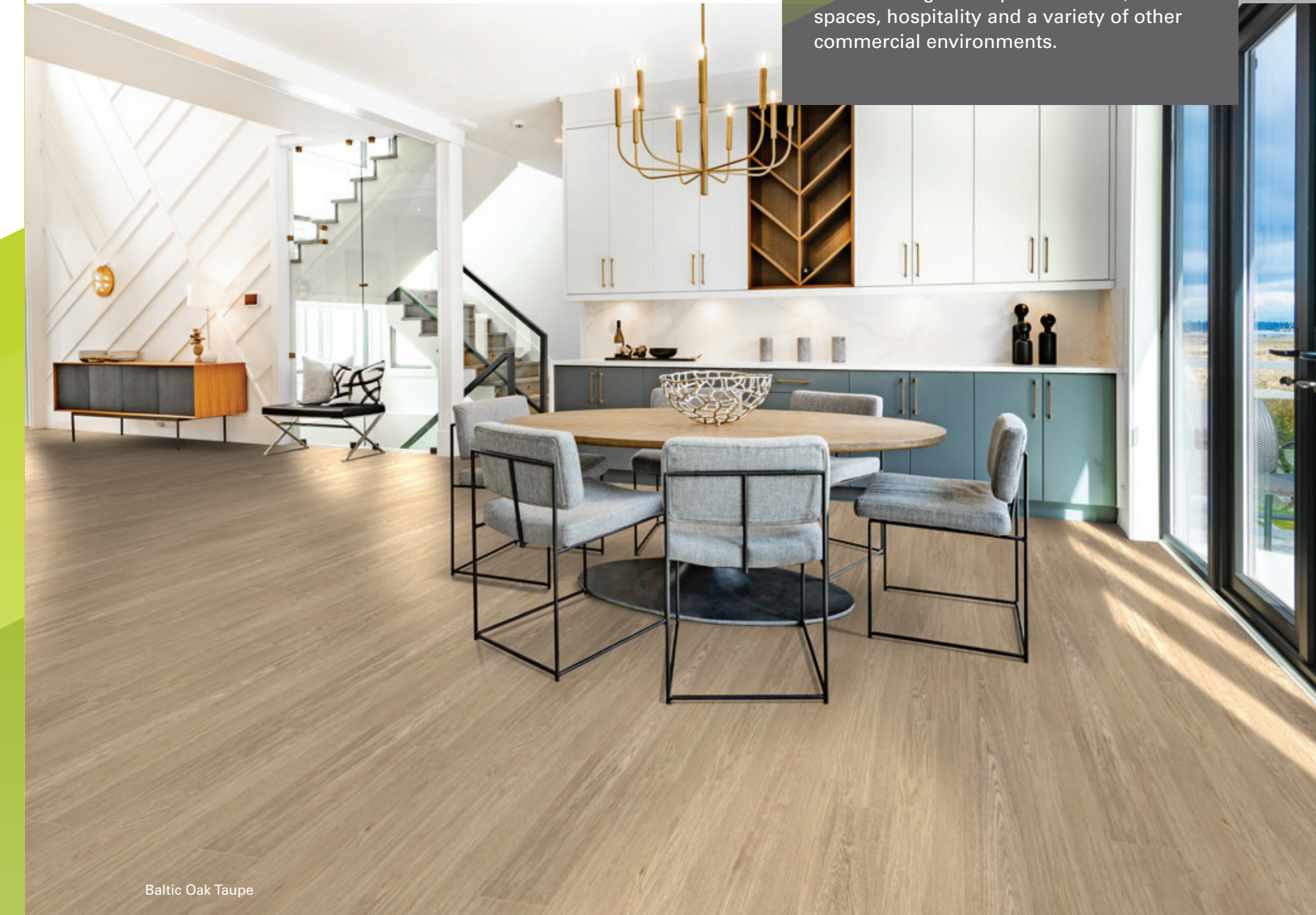
Baltic Oak Taupe

With 10 popular wood looks and realistic embossed surface, AVA® RYSE™ provides superior beauty and performance in 6" x 48" glue-down planks with a straight edge.