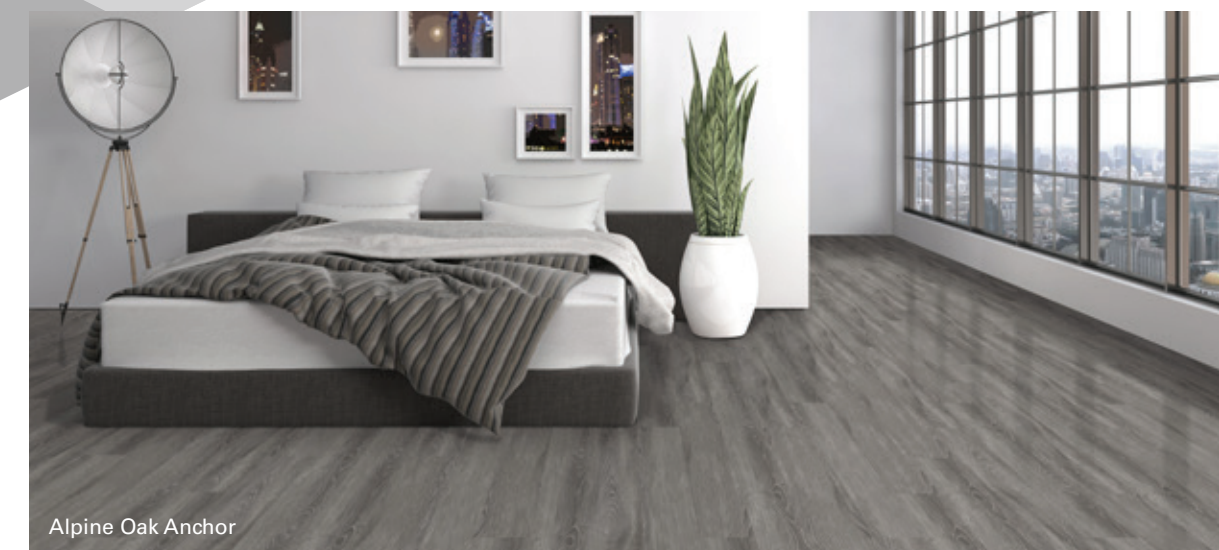
Alpine Oak Anchor