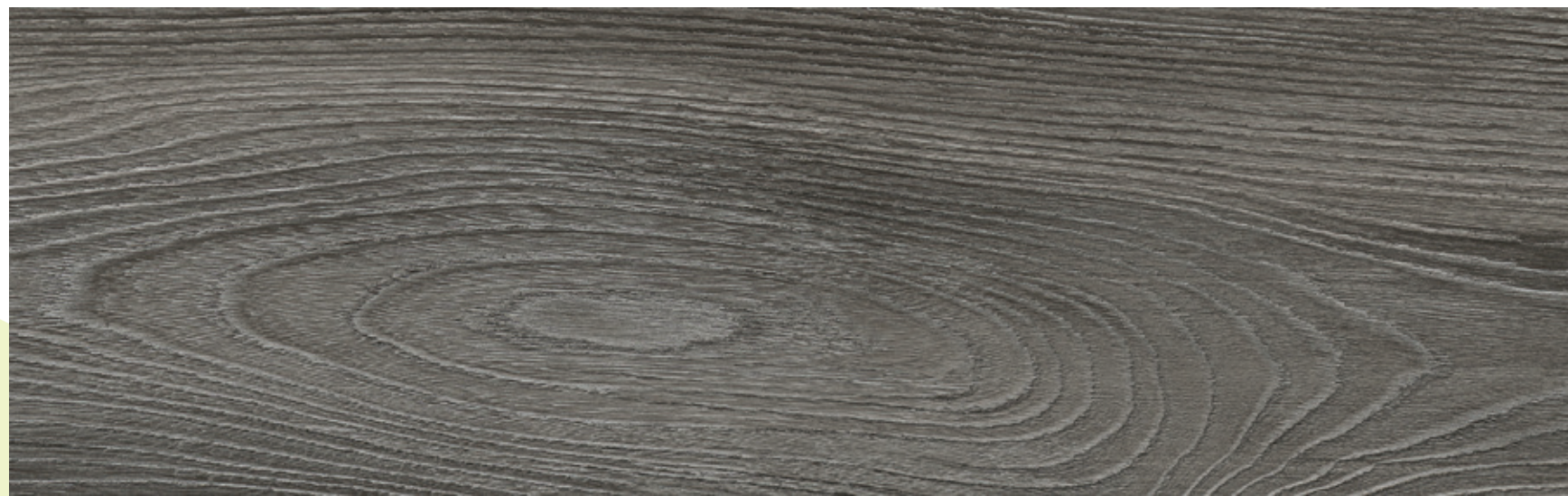
Alpine Oak Anchor