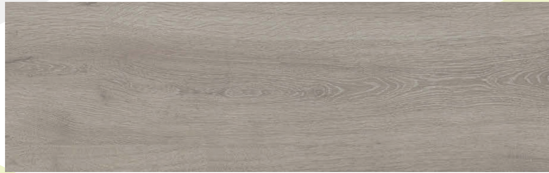
Tuscany Oak Snow