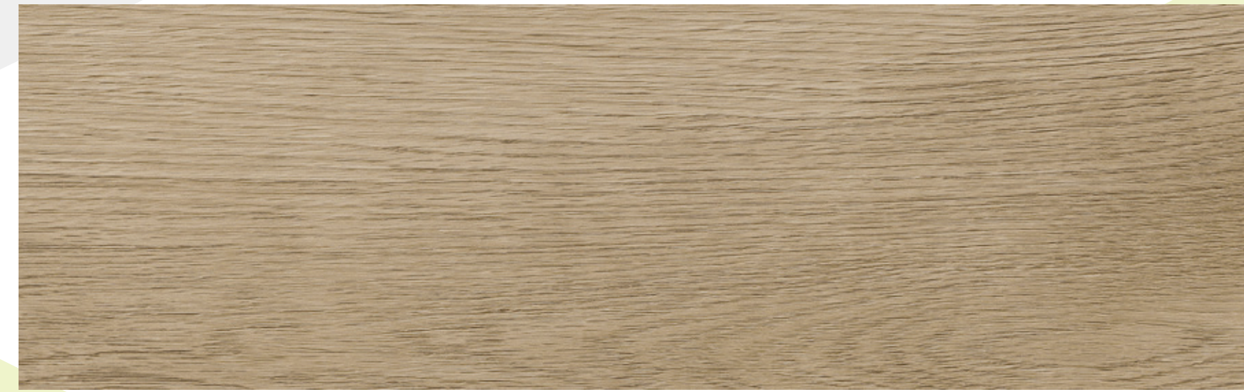
Baltic Oak Taupe