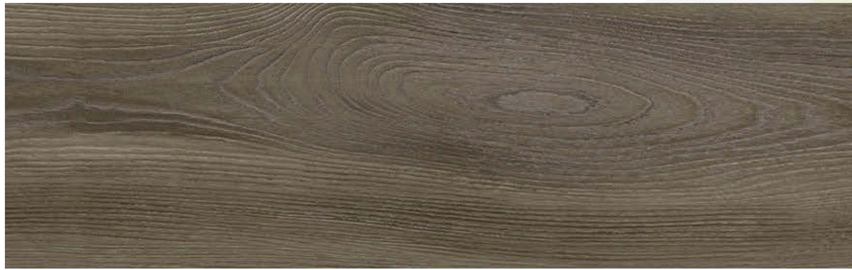
Alpine Oak Khaki