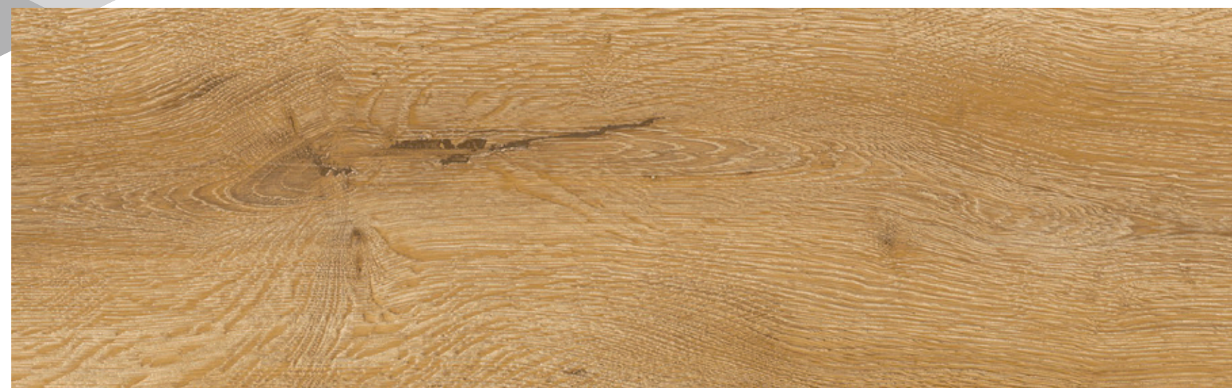
Tuscany Oak Medallion