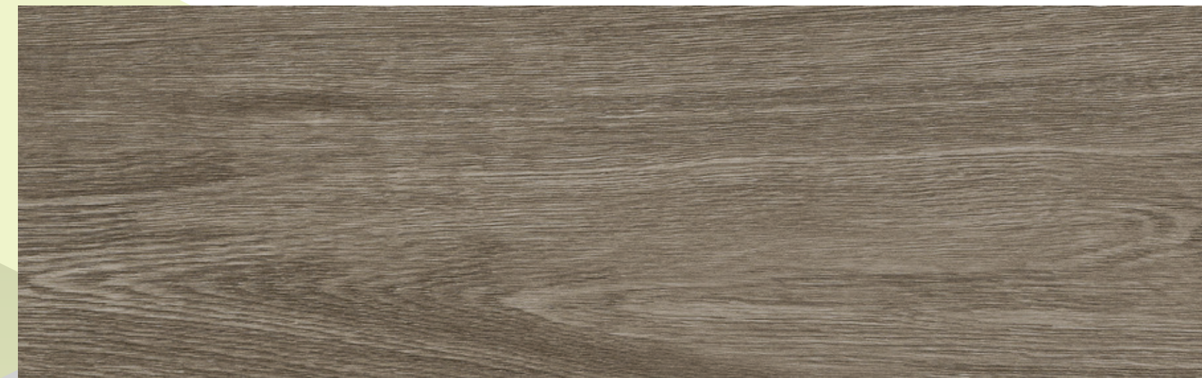
Baltic Oak Suede