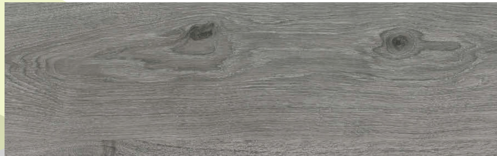
Tuscany Oak Mist