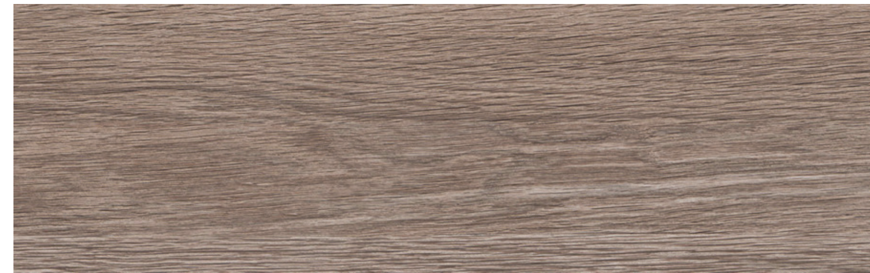
Peninsula Oak Plains