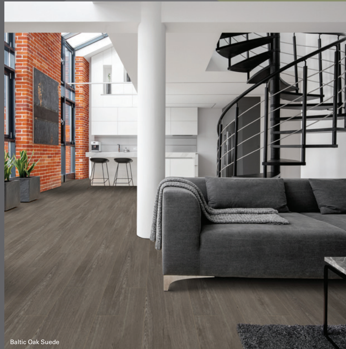
Baltic Oak Suede

avaflor.com • 877.861.5292 sales@avaflor.com