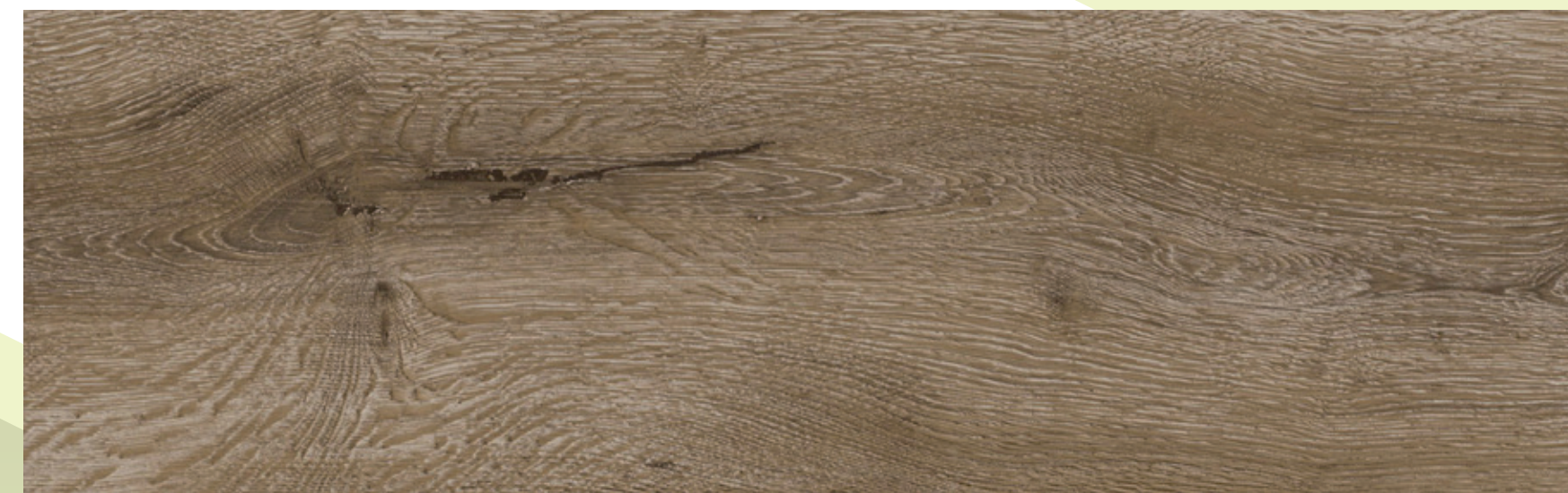
Tuscany Oak Peanut